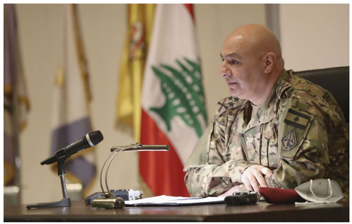
General Joseph Aoun criticizes Lebanese politicians during a meeting with Army cadres.

Trust in governmental institutions and the patronage networks with which they are entwined has been heavily eroded, as they have proved incapable of extricating Lebanon from its various crises. Though public aspirations for a technocratic government propose to solve this democratic deficit through competitive elections culminating in effective, non-sectarian governance, Lebanon's revolutionary movement is both leaderless and uncoordinated. It lacks a concrete agenda to address the sectarianism and self-interest that has been at the heart of the Lebanese state since its formation and that will almost certainly resist an agenda for change. Absent any realistic alternatives, the LAF is left as one of the few institutions that garners widespread support across the Lebanese public and is regarded suitable for helping address the country's compound crises.