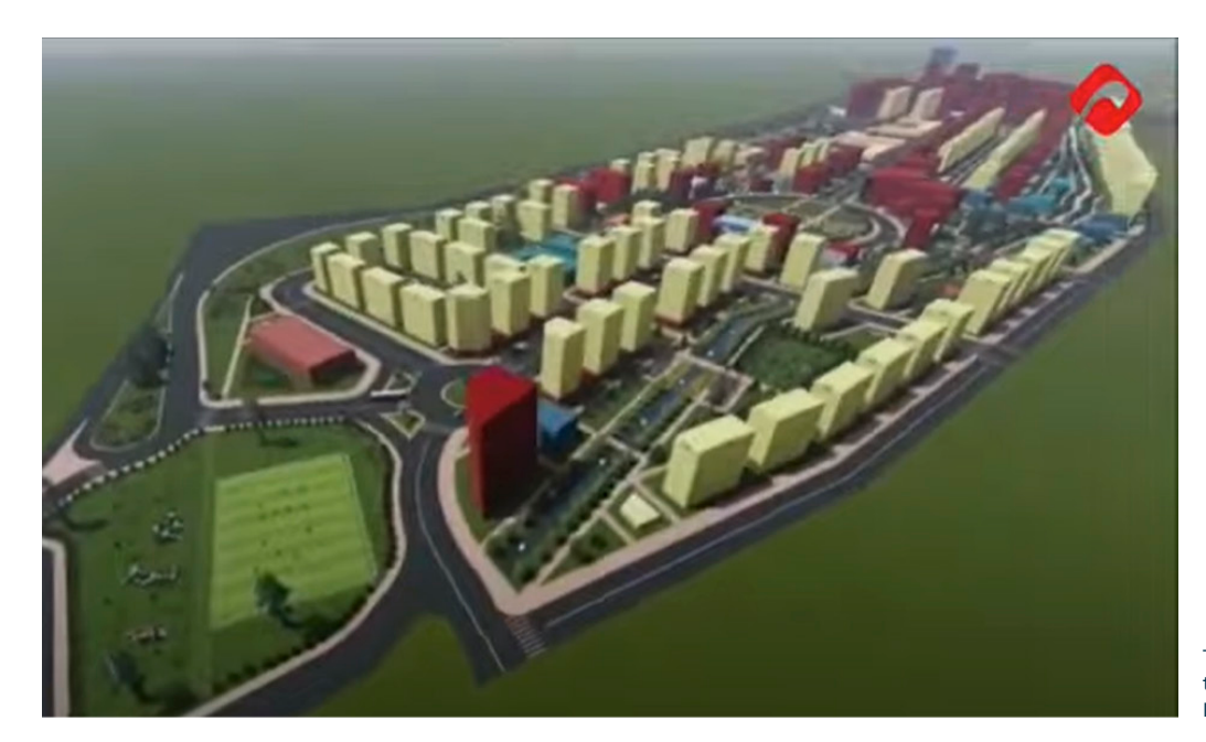
The proposed master plan for the Qaboun Industrial City.

Decree No. 237 showcases Syria's blueprint for reconstruction and urban development, which will deliberately prevent thousands of displaced Damascenes from returning. Those who fail to prove ownership will lose not only properties, but also their historical foothold in the city. Reconfiguring high-density neighbourhoods as medium- or low-density enclaves will drive prices up, drive out former inhabitants, and usher in a post-war elite. Rezoning industrial and agricultural areas is a necessary first step in this transformation, and in areas like Qaboun, it will batter once-flourishing local industry.