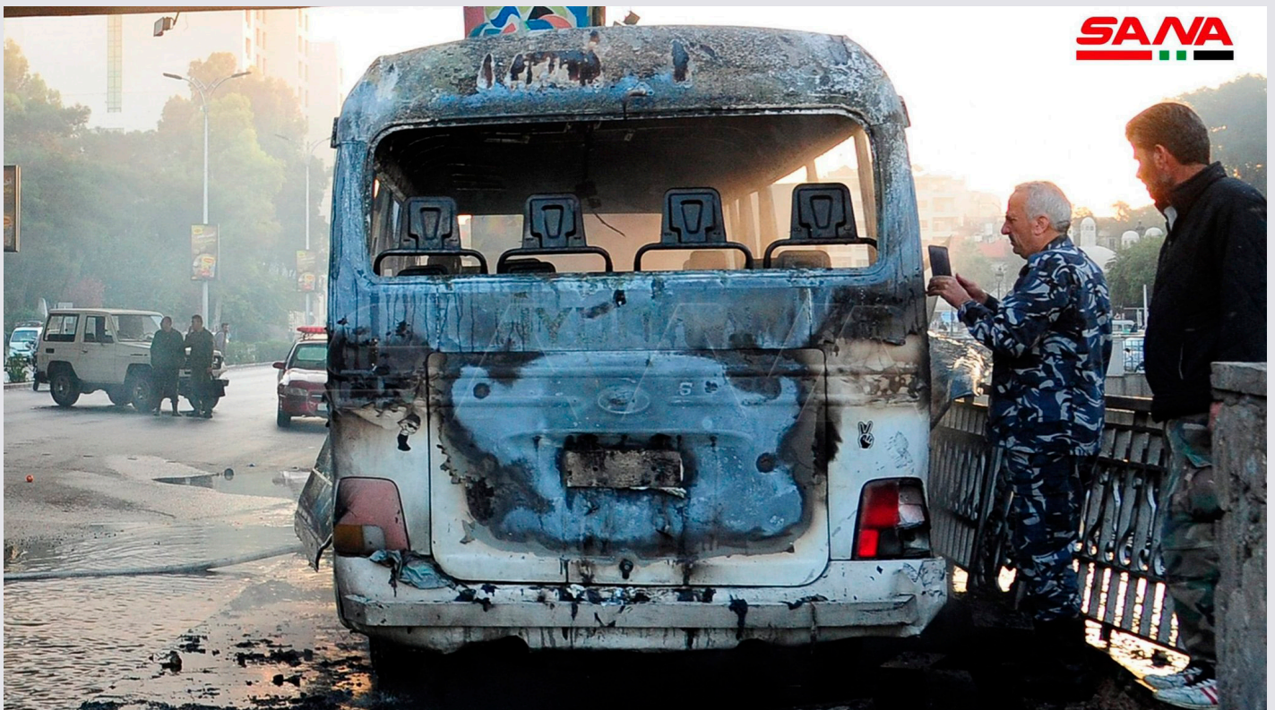
The wreckage of a Syrian Government bus following an IED attack in a highly secured area of Damascus.

The SDF continues to cooperate with Russia and the Syrian Government despite hostile statements Pg 8