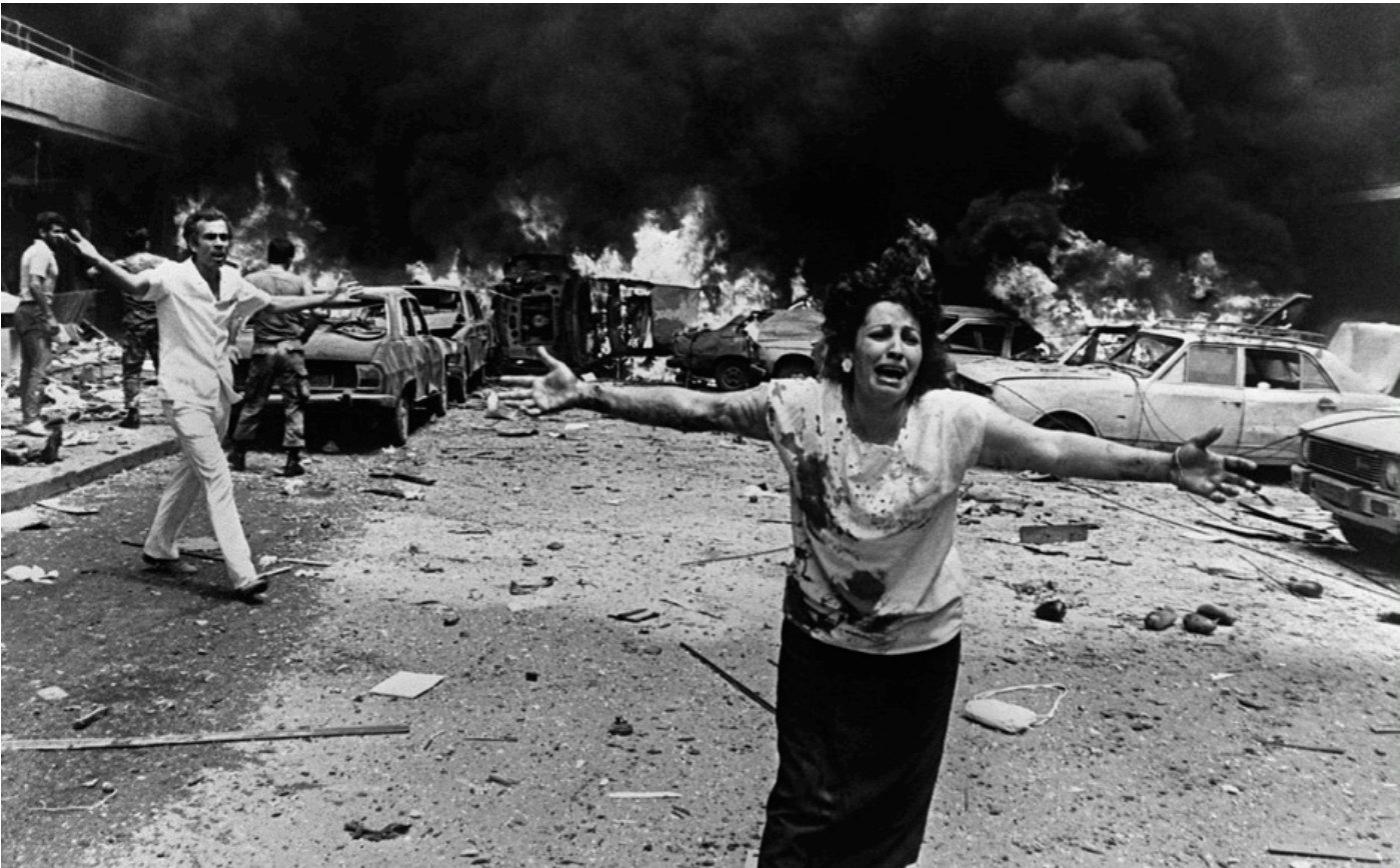
A photo from the April 1975 bus massacre in Lebanon, an incident marking the start of the 15-year Lebanese Civil War.