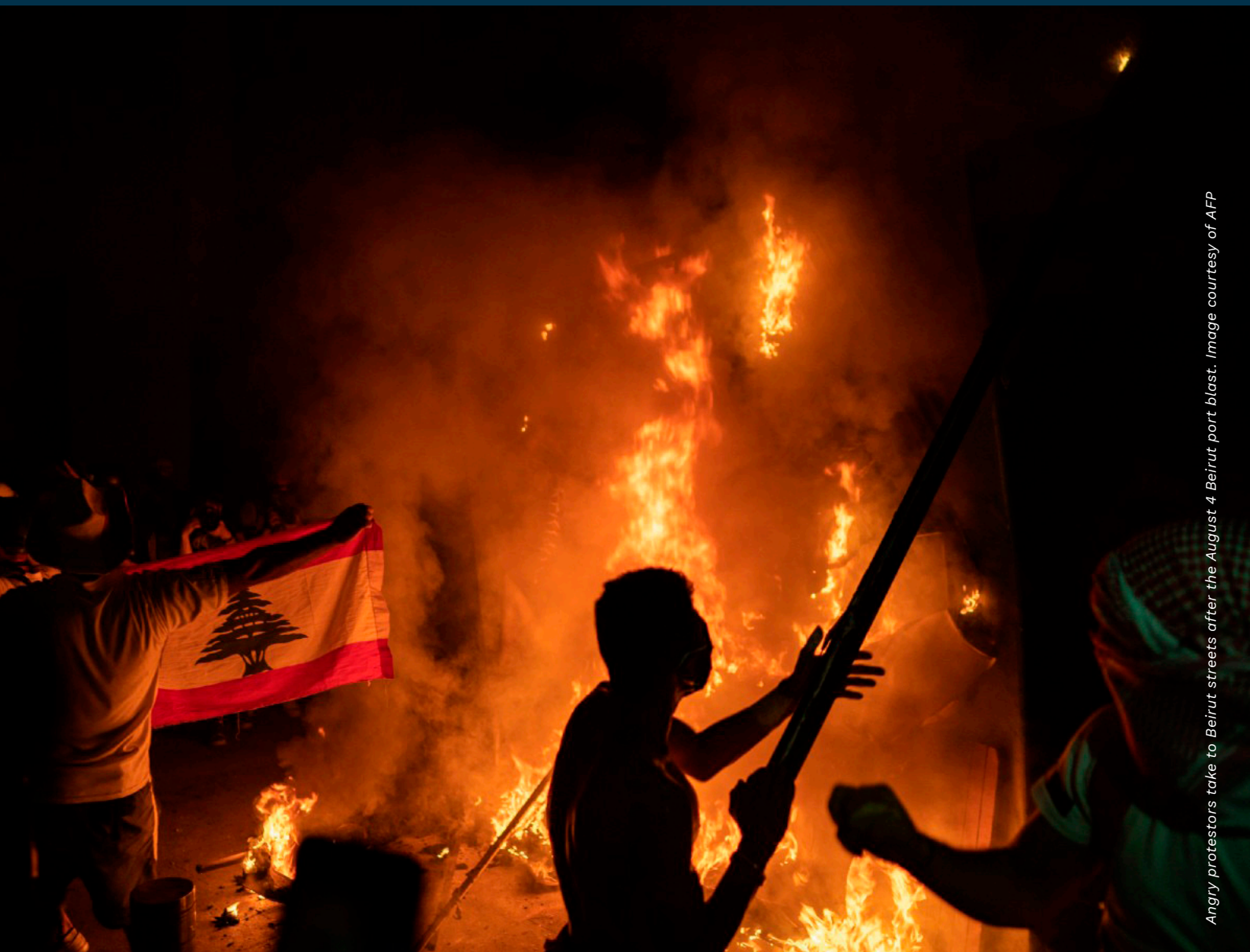
Angry protestors take to Beirut streets after the August 4 Beirut port blast.