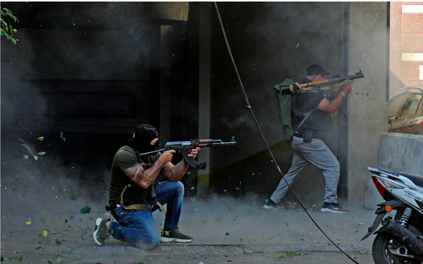
Investigation of Beirut port explosion triggers armed clashes in Tayyouneh between Shiites (Hezbollah and Amal supporters) and Christians (Lebanese Forces supporters) along a former civil war frontline on October 14, 2021.