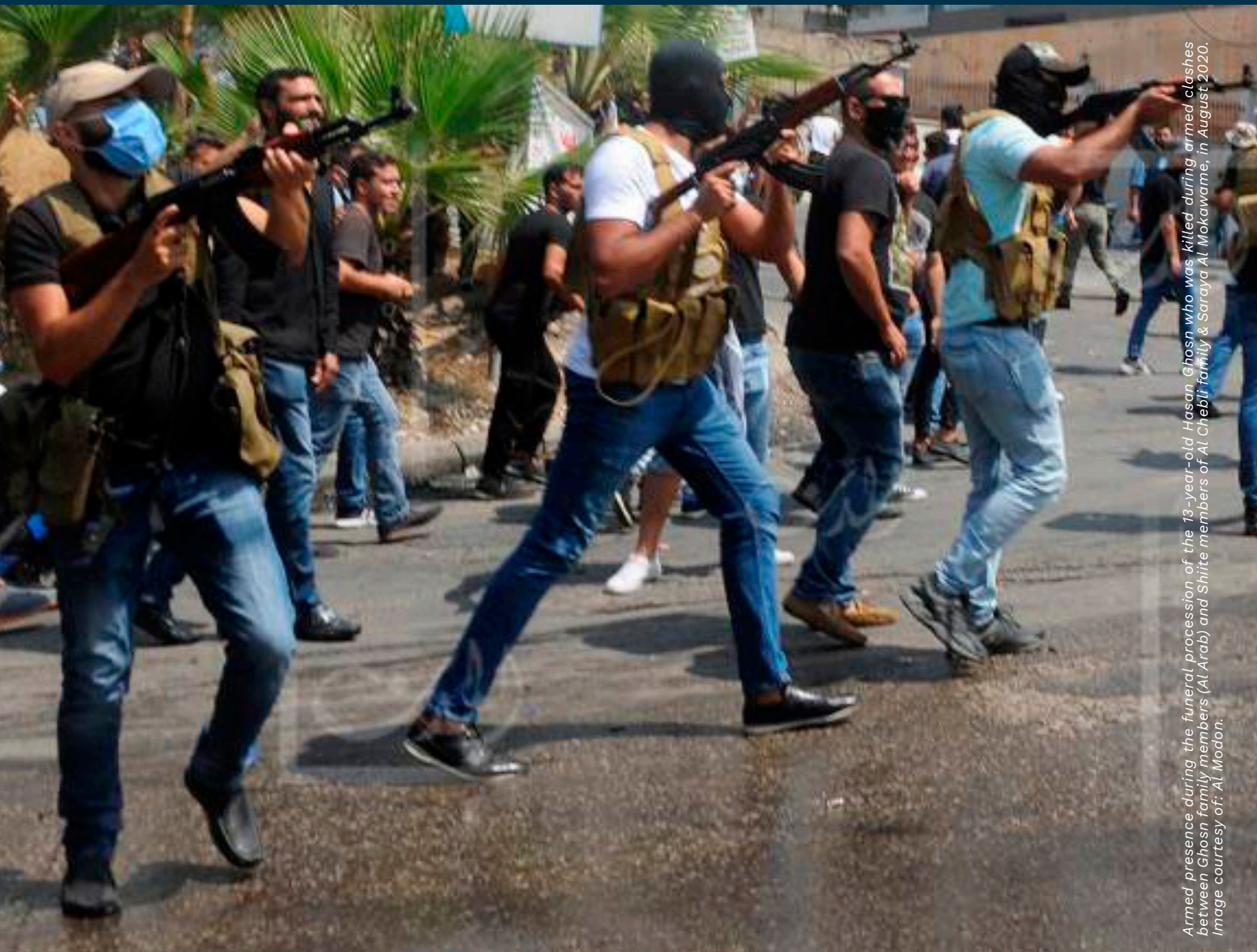
Armed presence during the funeral procession of the 73-year-old Hasan Ghosn who was killed during armed clashes between Ghosn family members (Al Arab) and Shiite members of Al Chebli family & Saraya Al Mokawame, in August 2020.