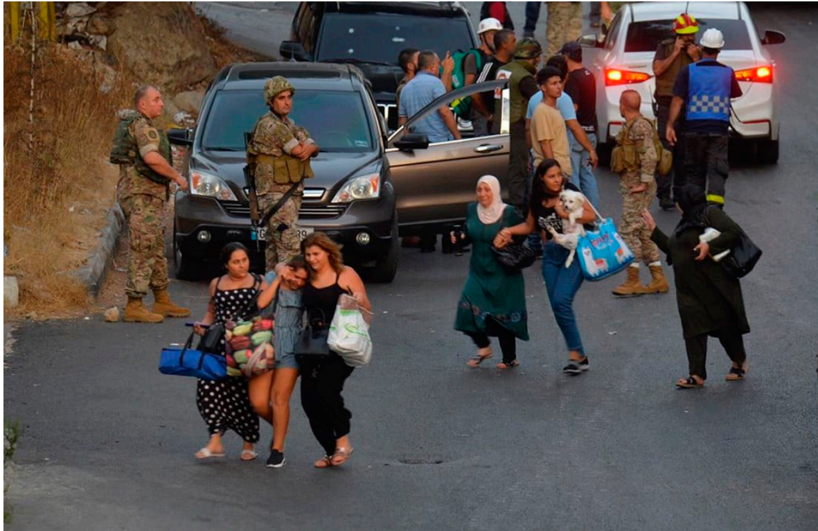
People are evacuated as the Lebanese Armed Forces deploy in armored vehicles amid clashes in Khalde area between Hezbollah members and members of the Sunni Arab Al Ghosn tribe, August 1, 2021.