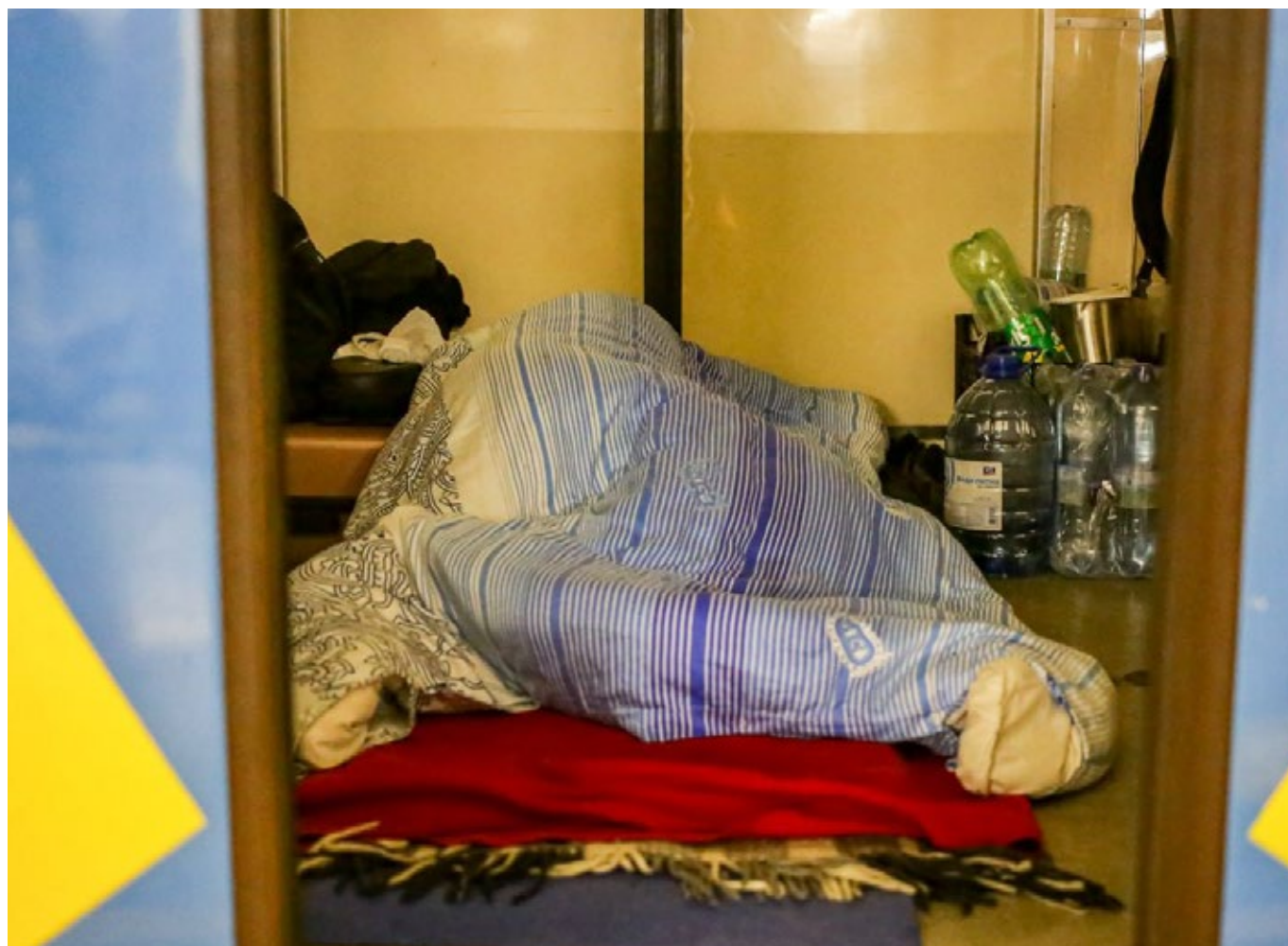
Sleeping on a metro train

While these conditions may not put able-bodied residents at immediate risk of hunger or life-threatening illness, they pose greater risks for the disabled and elderly. Locals have organized deliveries of milk and bread to residential courtyards to help feed these vulnerable groups, but it is unclear how systematic these efforts are. The degree to which these initiatives also involve the delivery of medicines is unclear. Aid providers should therefore keep the elderly and disabled in focus even in the event that a siege does not occur. It may also be useful to gather data regarding timing of airstrikes and shelling to help inform civilians of the times of highest risk, so that they can plan their errands accordingly.