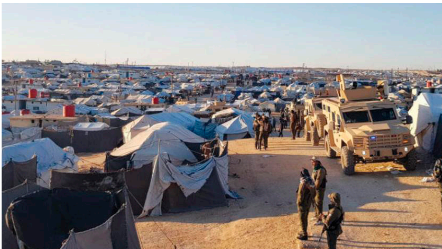
The SDF Internal Security Forces during a wide security campaign inside Al-Hol camp last March.

wave of displacement occurred as civilians — including family members of IS fighters — exited the final IS pocket and were relocated to the camp. Today, roughly one-third of the camp's population is Syrian, half are Iraqi, and the rest other foreign nationals. 42 Women and children account for 94 percent of the camp population. 43 The camp houses individuals with varying degrees of ties to the IS apparatus that ruled territory in Syria and Iraq, but also thousands of individuals with no IS association at all who flocked to the camp fleeing conflict. Humanitarian conditions in the camp