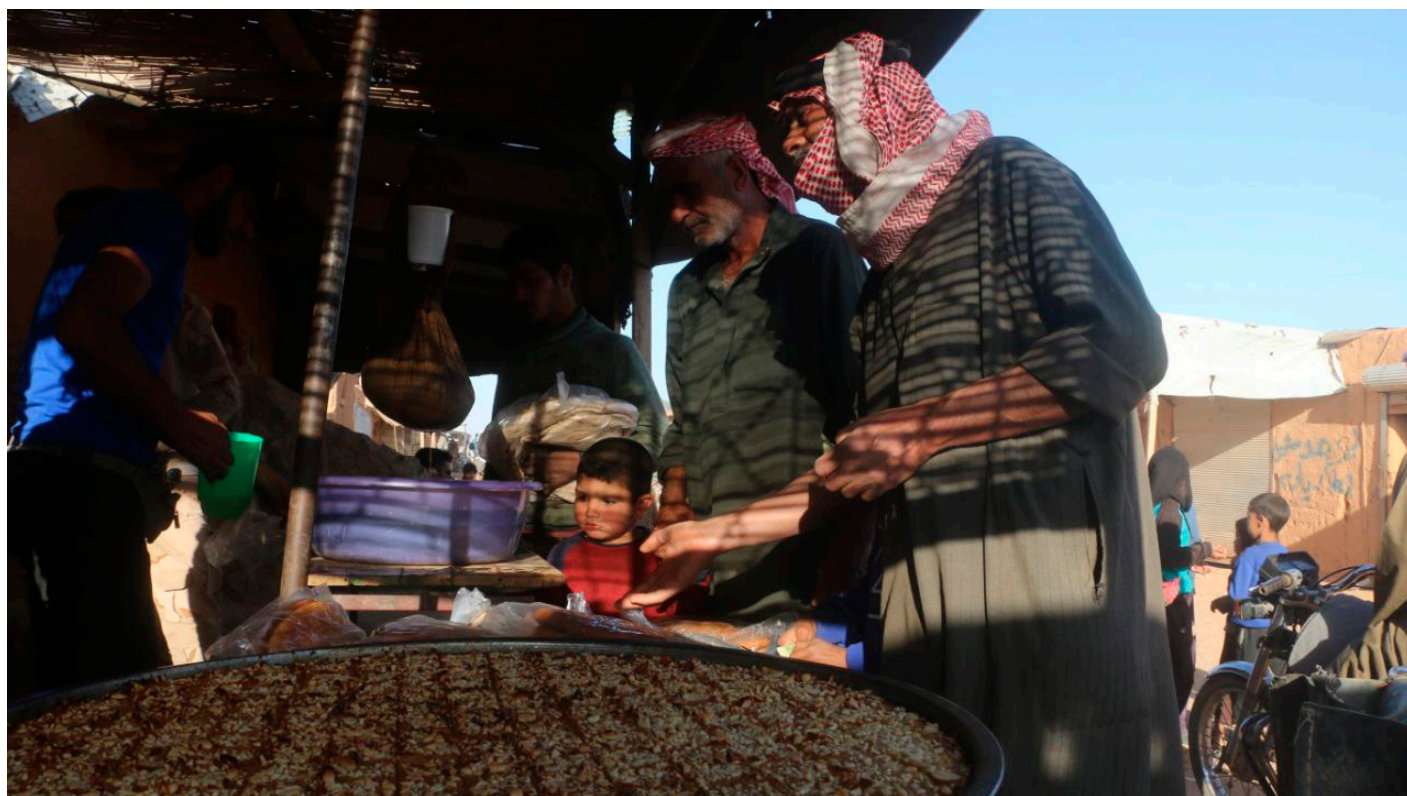
Rukban residents at the camp's market in 2021.

The governments of Syria and Jordan have substantially reduced the size of Rukban by limiting access to the camp, compelling many residents to leave for Syrian government-held areas. The camp's population of 85,000 at its peak in late 2016 27 has now diminished to between 7,000 and 10,000. Residents returning to Government of Syria areas have been detained,