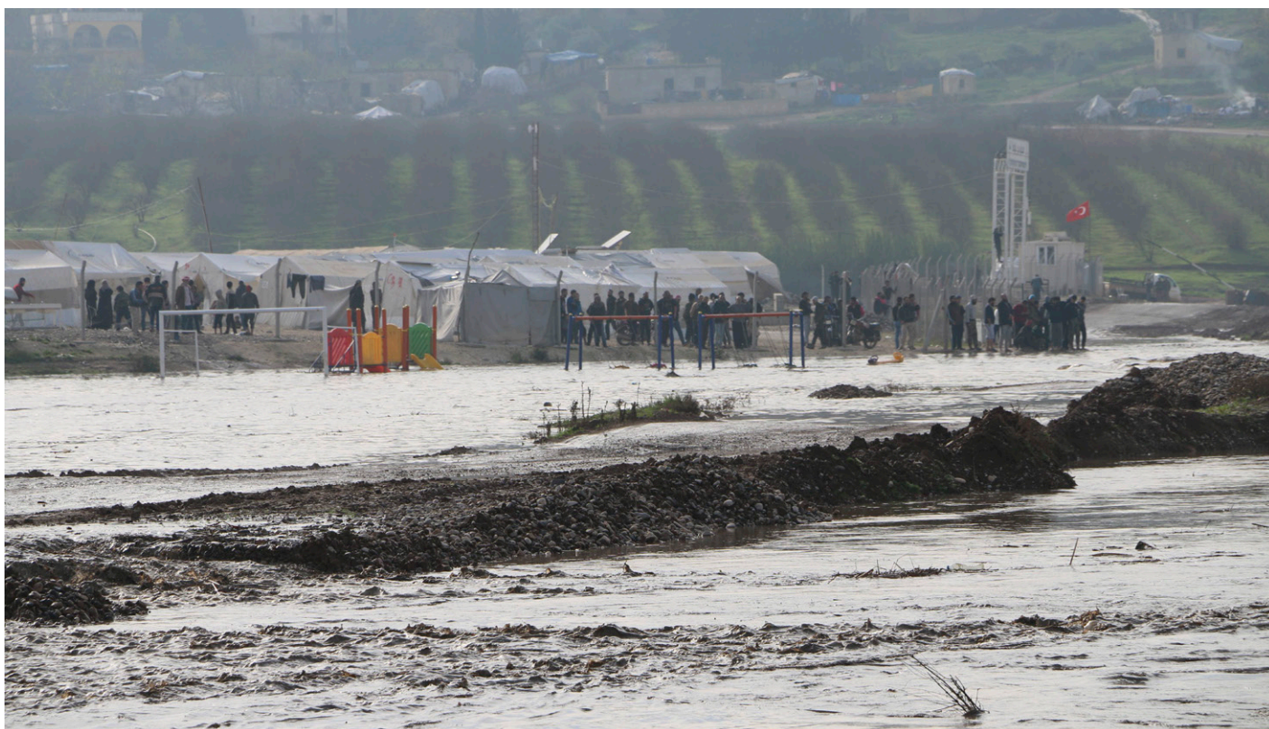
Deir Ballut camp flooded by Afrin river water, 20 December 2018.

Location susceptible to flooding. The camp's position in a valley makes it highly susceptible to flooding in the event of heavy rainfall. Residents' requests to move the camp to a location that is safer from floods have gone unheard. Residents largely live in tents or in walled residences without permanent roofs, which do not fully protect from the heat in the summer and from rain and wind in the winter.