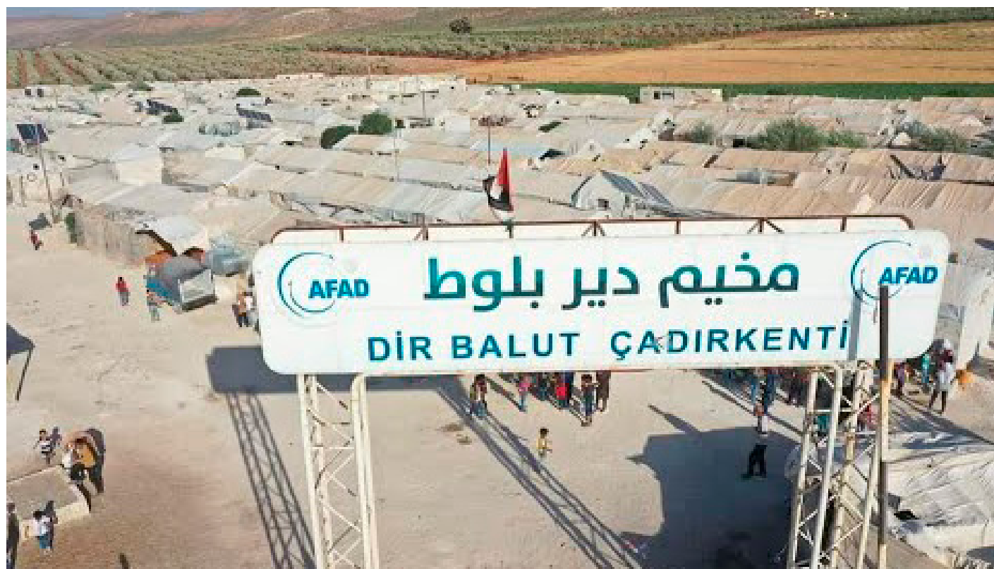
The entrance of Deir Ballut camp.

government and its allies. The camp's Turkish management, AFAD, maintains security and provides essential services to residents such as bread, basic health care, water, and education. These conditions, although far from ideal, still make the camp a better place to live than many other camps in Syria's northwest. Nevertheless, the camp is highly susceptible to flooding during periods of heavy rainfall, with many residents living in tents that do not offer protection from extreme weather. Most camp residents lost everything they owned when they were displaced and therefore cannot afford to leave and pay rent, let alone buy