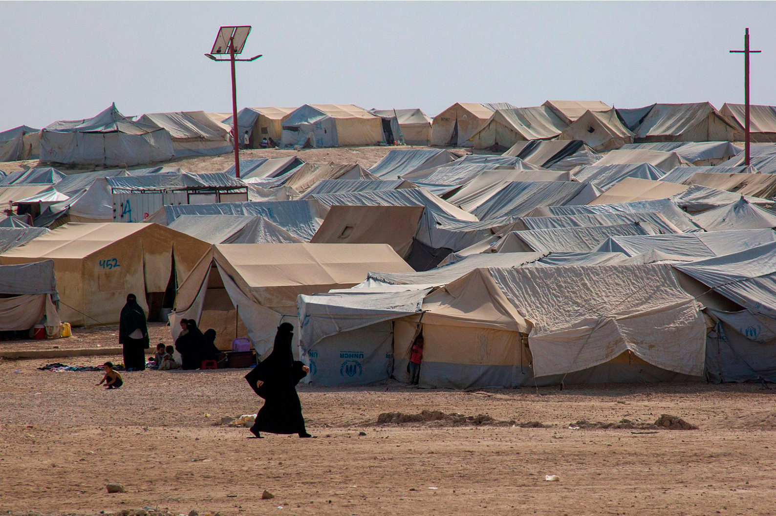
Women and children in the Hole camp in northern Syria.