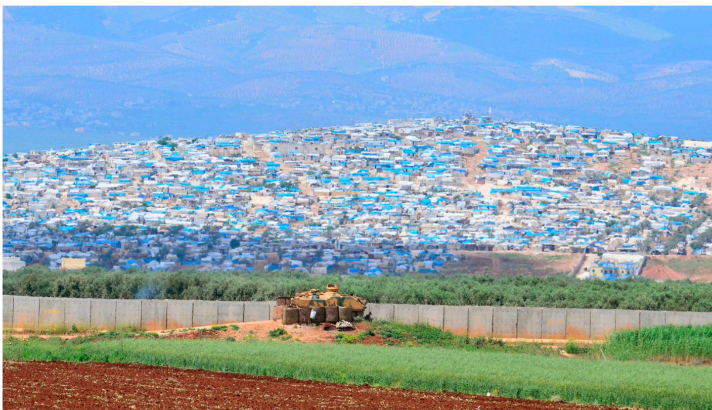
Atma received tens of thousands of IDPs in mid-2019, as a result of the Northwestern Syria offensive.

Better understood as a collection of camps rather than a cohesive whole, each individual camp is largely inhabited by people from the same town or village, providing networks and social support systems. Nevertheless, Atma residents