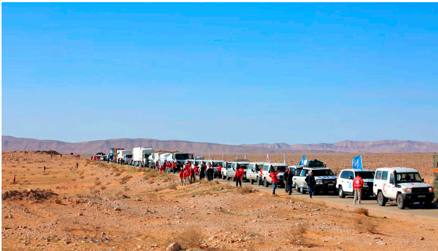
A UN-SARC convoy carrying humanitarian aid to Rukban camp in September 2019.

of the 55-kilometre zone, which US forces prevent them from entering. 23 As a result, humanitarian access, food, medical supplies, livelihoods, and services are limited, if not altogether absent. Robust smuggling routes through the western Badia desert have been a lifeline for the camp since its formation in 2014, 24 although high prices have strained residents' meagre remittance-based wages. The Syrian government's decision to halt smuggling to the camp in February 2022, as it has done periodically in the past, has shut down the camp's sole bakery. Remaining residents